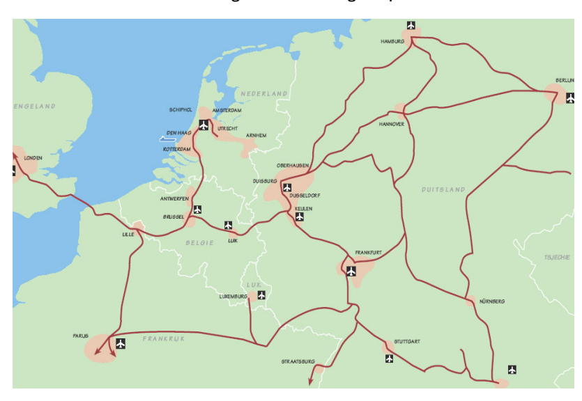
Figure 4 High-speed connections in Northwest Europe (>200 km/h)

The following example illustrates the importance of properly coordinated promotion efforts. International companies visiting the EU in Brussels to talk about a suitable place of business in the Eurodelta area as the "Western Gateway to Europe" are given a documentation folder including the following map.