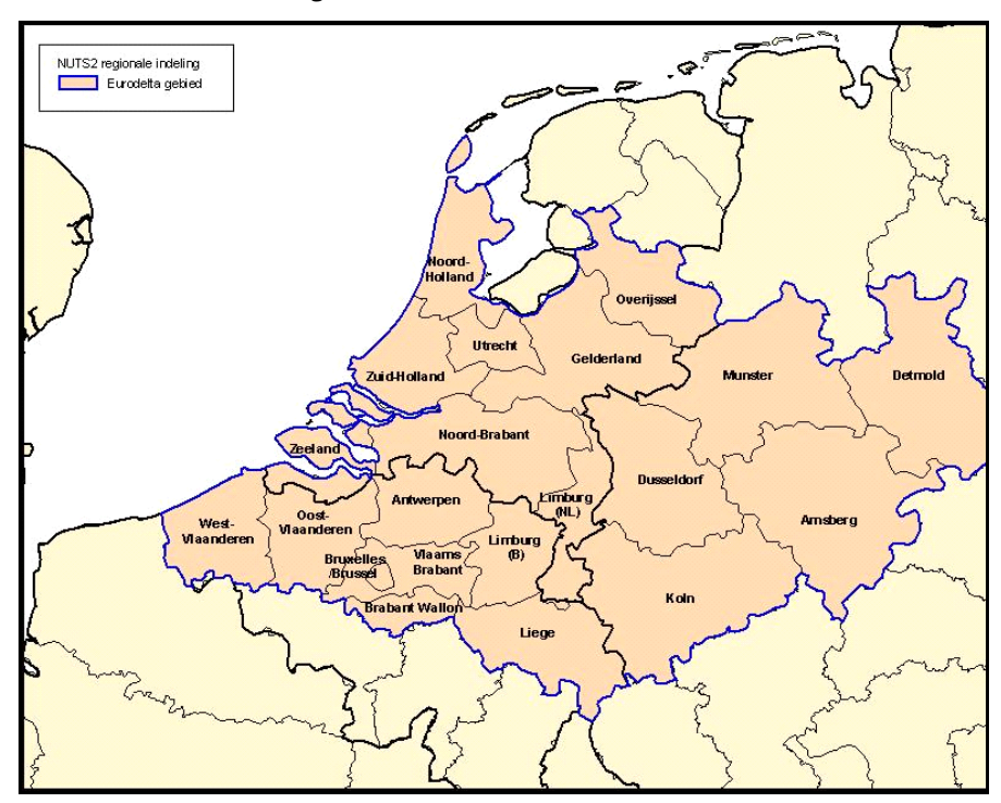
Figure 1 NUTS-2 regions included in the Council's hypothetical research area

Just to be perfectly clear: the area defined is a preliminary research area . The Council does not recommend marking the area in an administrative sense.